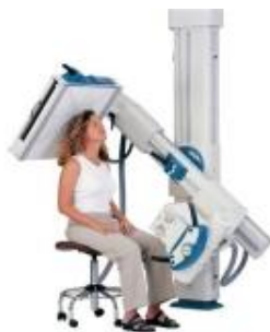
Univ. Digital Radiography Systems