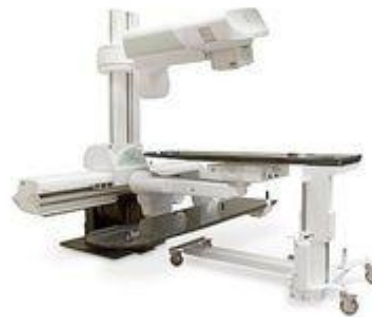
Multipurpose digital R/F system, remote-controlled tilting table