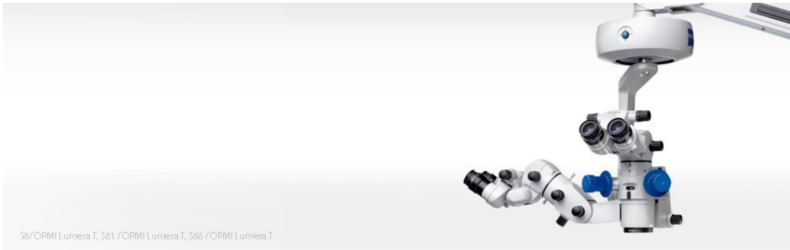
S8/OPMI Lumera T, S81 /OPMI Lumera T, S88 /OPMI Lumera T